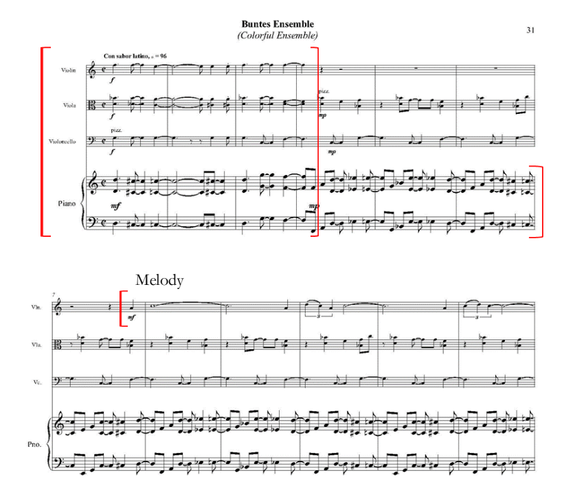
Example 5. Sierra's Kandinsky, "Colorful Ensemble" mm. 1–12

Colorful Ensemble, the final movement of Kandinsky , caps Sierra's "musical display" with all four instruments joining in a harmonious (tonal) popularly-inspired classical version of the famous Cuban son , El Manicero (Peanut Vendor) by Albert Gómez. This movement presents varying gestural designs, opening with instruments playing in tutti at mm. 1–3, and setting off the rhythmic syncopation that follows on the piano. The melody of El Manicero , transformed of course, is placed on the violin at mm. 7–47. It is then taken over by the piano at mm. 39–45, the viola at mm. 48–55, and cello at mm. 56–62. The canon structure of the movement is often supported by the instrumental accompaniment (especially the piano), playing syncopated rhythms. In such manner, Sierra accentuates the idea of an "ensemble" by separately highlighting each of the instruments, while at the same time showcasing the popular character of the movement without breaking with rhythmic regularity. Between mm. 63–76, the strings play against the piano accompaniment, in polyphonic (two-voiced) syncopation, returning to the melodic structure at mm. 82–112.