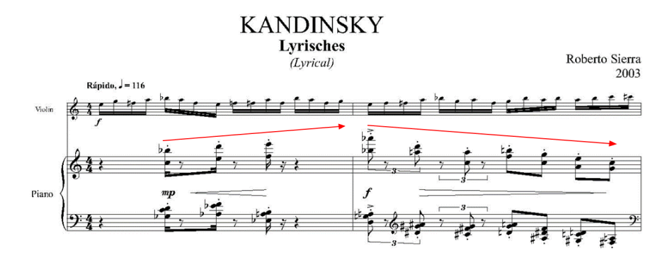
Example 1. Sierra's Kandinsky, "Lyrisches" mm. 1–2

Throughout the piece Sierra creates varying textural changes, for example by reducing the piano to a single descending line ( subito , mm. 23–24), somewhat mimicking the gravitational force of the heavy blue object at the bottom right edge of Kandinsky's 1911 piece.